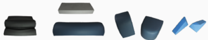
SlipStop Traction Blocks and cushions