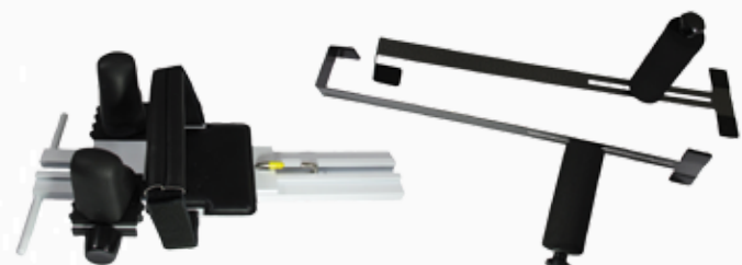
Clinical Cervical Device