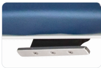
TABLE EXTENDER (ACCESSORY)

Multiple locations allow you to choose the best spot for this easily installed & removed accessory capable of handling up to 150 lb (68kg). Can be used with any American standard accessory. 8" (20cm) L