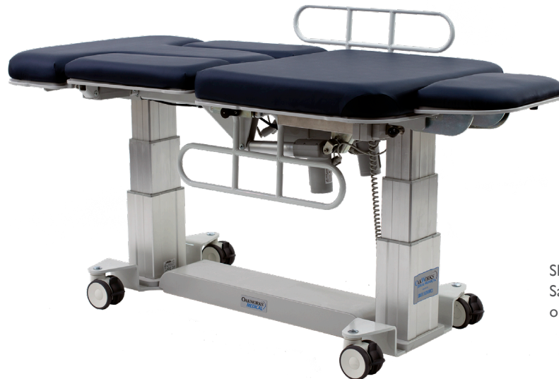
Shown in Sapphire fabric with optional side rails

Our new EA Line of tables incorporates all of the ergonomic features and comfort our tables have had for years with new powered features that speed up exam times and make positioning patients easier. From powered leg sections and access panels, to multiple motions occurring at the same time, these tables live up to their name.