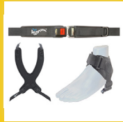
PoziForm Belts & Harnesses