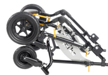
Frame folded for easy transport and storage