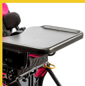
Upper Extremity Support