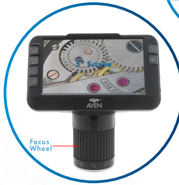
Crystal Clear 5" Screen