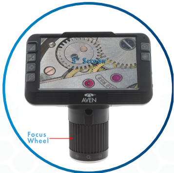
Crystal Clear 5" Screen