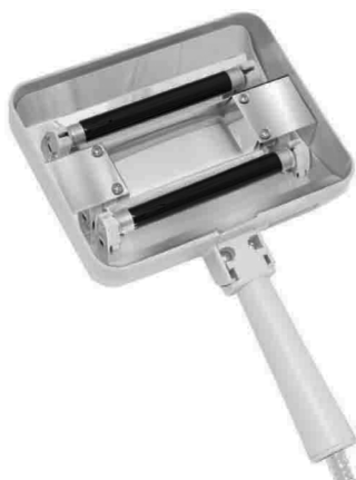
Model 2200 Q-Series Long Wave Ultraviolet Magnifier Lamp