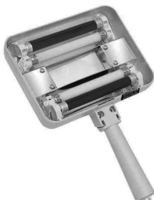
Model 2203 Q-Series Long Wave Ultraviolet with White Light Magnifier Lamp