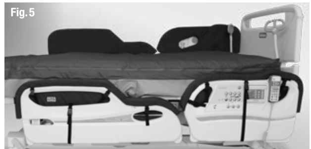
Posey Seizure Side Rail Pads