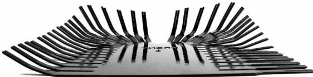
ADJUSTABLE TECHNOLOGY INSERT (ATI)

*Zero Elevation with GlideWear® Pictured