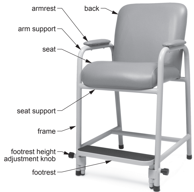
Hip Chair with Adjustable Footrest, Shown Assembled