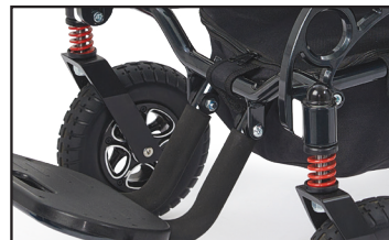
Comfort Spring Suspension for a Smooth Ride