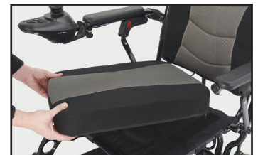
Removable Padded Seat