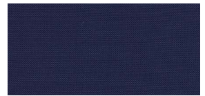
SILVERTEX SAPPHIRE BLUE