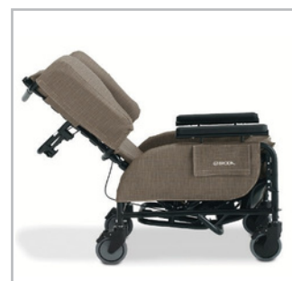
Posterior tilt aids in pressure redistribution