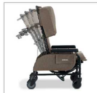
Rocking motion helps calm agitation, creating a soothing effect