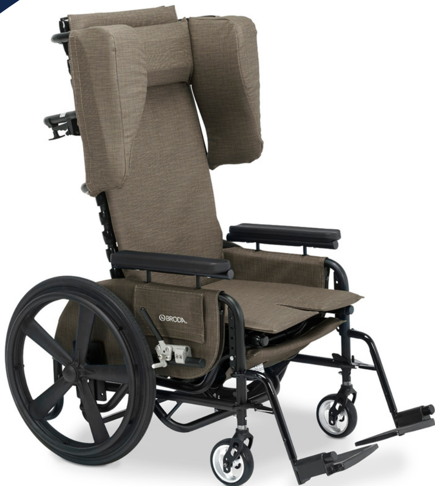
Shown with optional rear mag wheels and swing-away lower leg supports