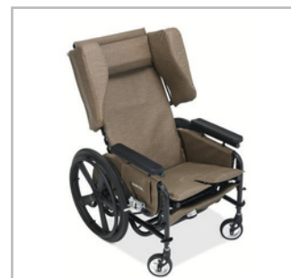
Front pivot seat tilt enhances visual orientation and encourages self-mobility with proper foot-on-floor positioning