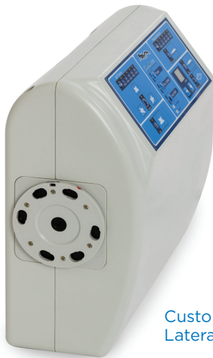
Customized Lateral Rotation