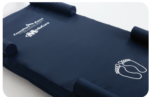
Side bolsters for optimum patient safety reduces the risk of falling.