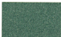
Silver Sage Patina EG01