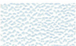
Textured Diamond White EG09