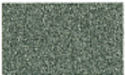
River-Rock Granite EG05