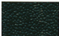
Textured Onyx EG08