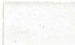
Pearl White EG11