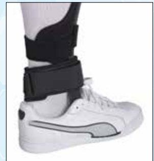
For Pes Valgus Control