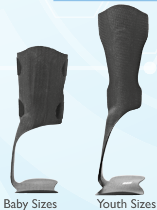
Baby Sizes Youth Sizes