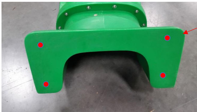
Top Piece mounting flange.

It is recommended to predrill holes on the wooden platform to avoid damage to the platform.