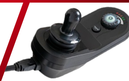
40A, Dynamic LiNX controller