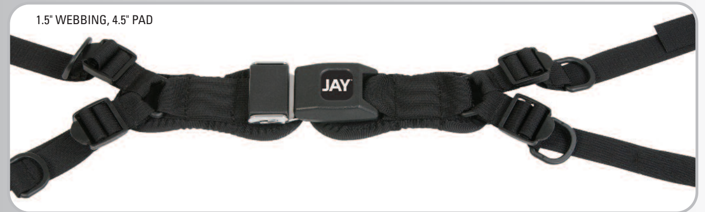
1.5" WEBBING, 4.5" PAD