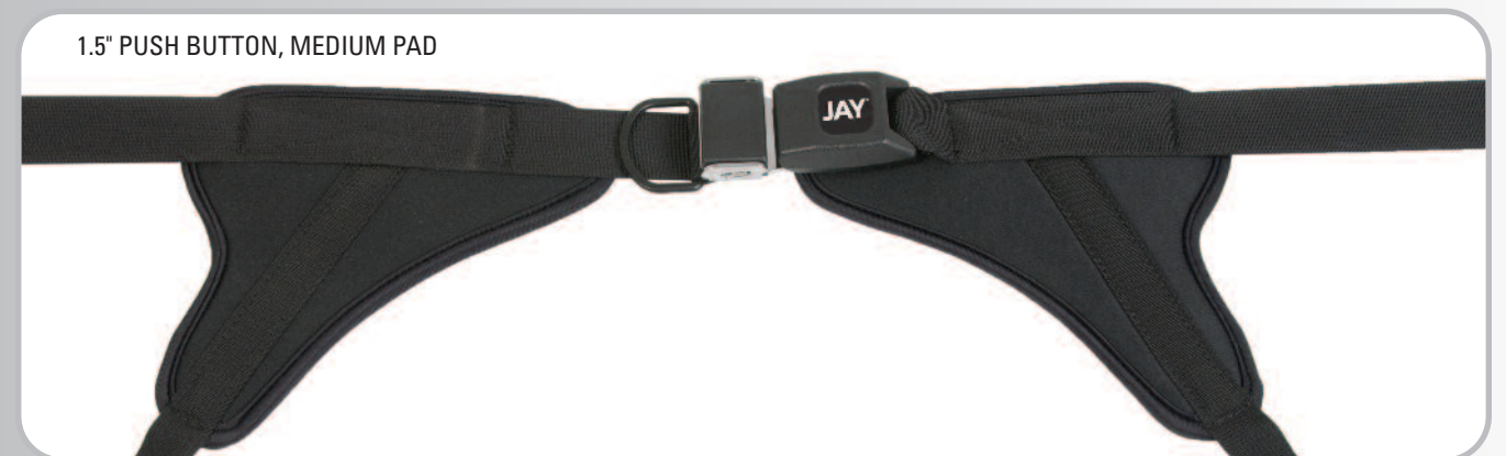
1.5" PUSH BUTTON, MEDIUM PAD