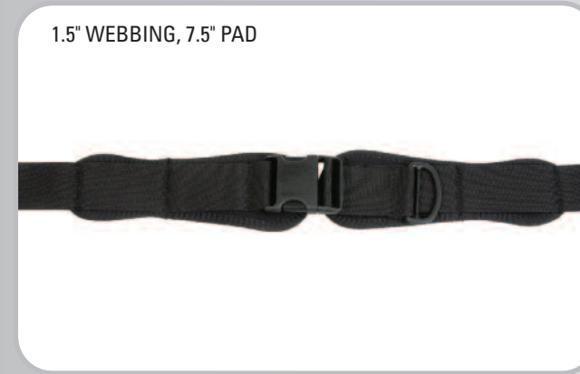
1.5" WEBBING, 7.5" PAD