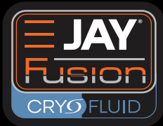
JAY Fusion Cushion with Cryo Technology