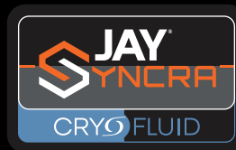
JAY Syncra Cushion with Cryo Technology