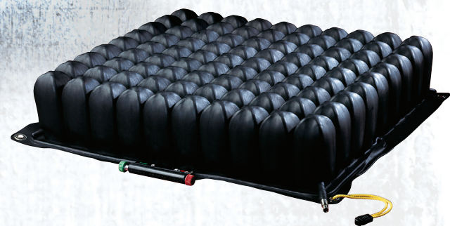
QUADTRO SELECT HIGH PROFILE

SELECT Series Cushions set the standard in the industry for overall performance in wheelchair seating. With the benefit of a customized fit through the simple push of a knob, the revolutionary ISOFLO MEMORY CONTROL® offers shape fitting capabilities while you are seated, allowing quick and easy, on-demand adjustment to maximize function. With the built-in stability and simplicity of a SELECT Series Cushion, no longer will you have to sacrifice maximum skin protection to get stability, positioning or convenience.