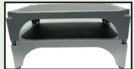
New version (bottom) stacks with the older version (top)