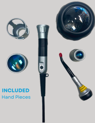
INCLUDED Hand Pieces

The included kit provides contact and non-contact lenses from 5 mm to 30 mm. These lens options adjust the depth of penetration and the intensity of the laser light, which can enhance patient safety, maximize therapy results, and minimize potential side effects.