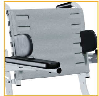
Molded Lateral Supports