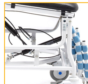
Rust-resistant frame and components are durable and long-lasting