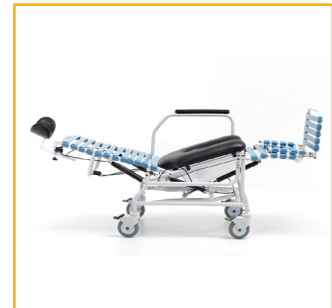
Multi-positional functionality with tool-free adjustability for ease of use