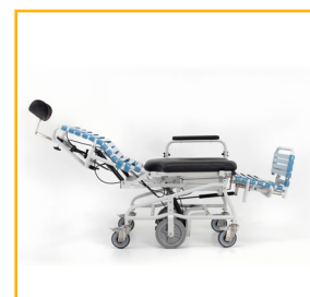
Mid-mounted Mag Wheel provides increased maneuverability