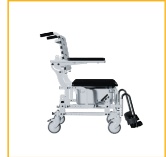
Features a range of simple adjustments for seat depth, wheel position, seat height, and more.