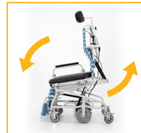
Anterior tilt aids in patient transfers and ease of patient care