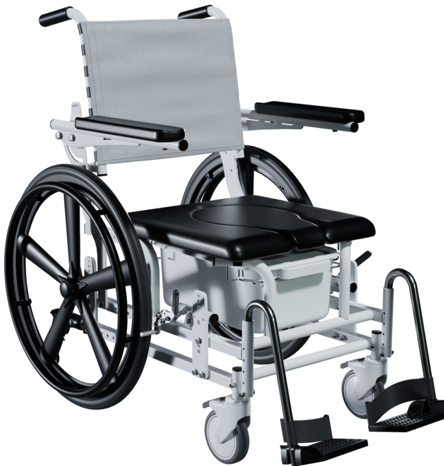
Shown with standard mag wheel configuration and optional commode pan and basket