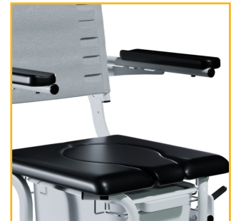
2-in-1 solid seat and commode is highly-versatile and easily mountable in all four directions