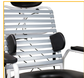
Multiple configurations available to accommodate unique needs