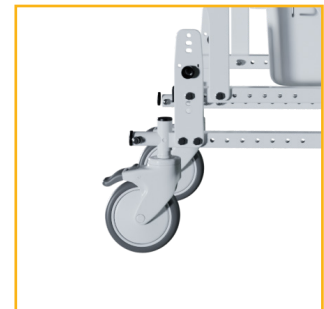
Configurable with either user-propelled mag wheels or cost-effective casters