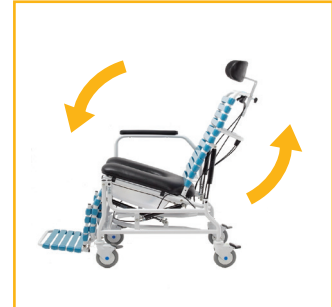
Anterior and posterior tilt aid in fall prevention and safe patient handling