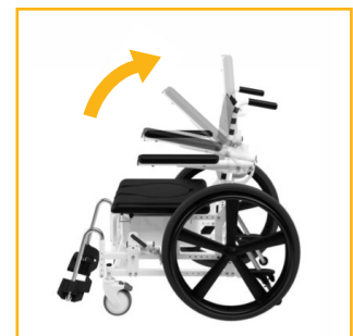
Flip-up arm supports and swing-away leg supports allow for easy bathing and transfers