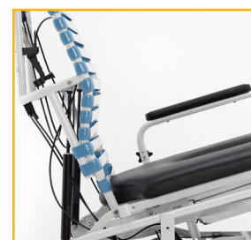
Optional concave back accommodates and supports gluteal shelf