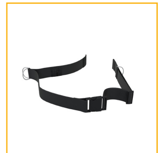
Pelvic Positioning Strap