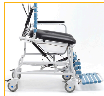
Rust-resistant frame and components, with a 10-year warranty