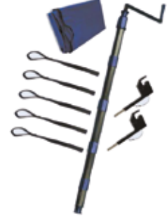
The Convertible Chair Patient Transfer System kit