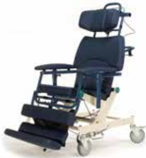
The Convertible Chair H-250