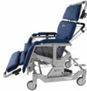
The Convertible Chair I-400