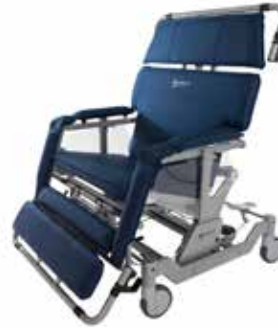
The Convertible Chair I-700