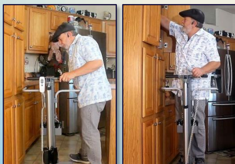
Standing Function: Reaching a Tall Cabinet