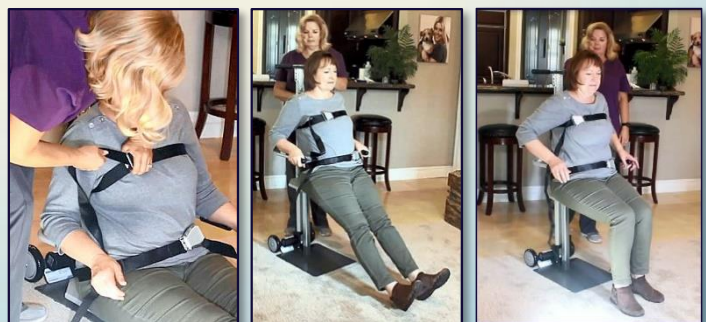
Dual Belt Assemblies for Additional Safety