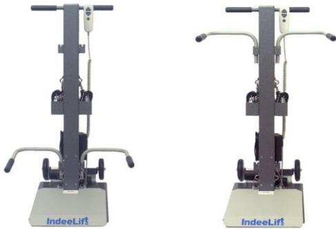
Removable Rise-Assist Handles

The Floor-To-Stand (HFL-FTS) is a lift & transfer tool that enables safe patient handling by eliminating manual patient lifting in a variety of situations. The FTS raises individuals to a standing position from any practical location one might sit; wheelchair, commode, couch, bed, or even the floor!