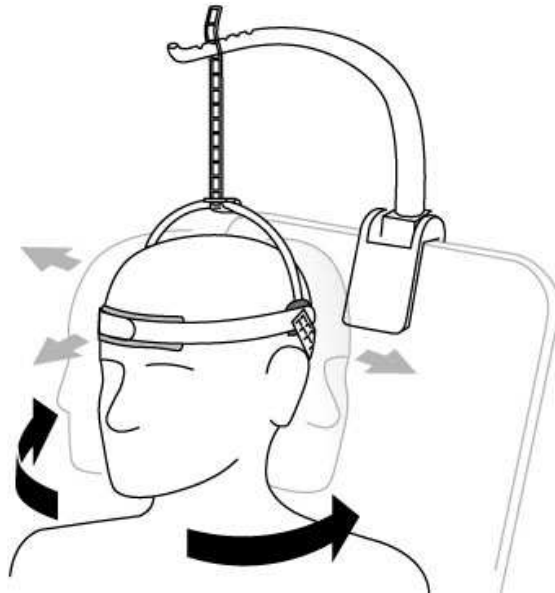
Fig. 1 Movements permitted with the use of Headpod