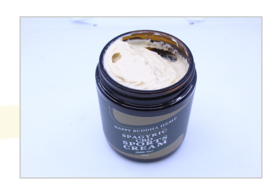
Unit: 4oz | Units Per Package:1

Analyzed via AAM-001 using Agilent 1220 HPLC-DAD. Limits are based on CO 6 CCR 1010-21. Sample was analyzed as received. Deviations from SOP: None.