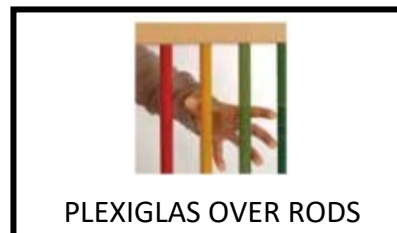
PLEXIGLAS OVER RODS