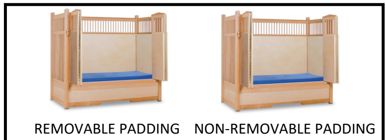
REMOVABLE PADDING NON-REMOVABLE PADDING