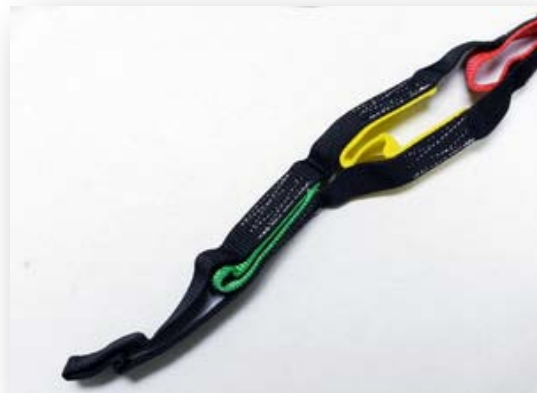
Permanent Creasing of Loop Strap