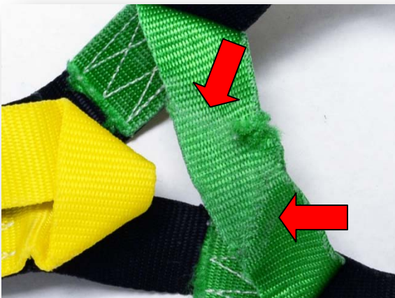
Surface Abrasion at Creases

Surface Abrasion / Color Loss especially at creases or areas frequent use. Stiffened or brittle fabric will usually wear excessively around the creases and areas that come into frequent contact with other object. The surface and edge abrasion is a result of this and will usually be accompanied by loss of color with a chalky appearance