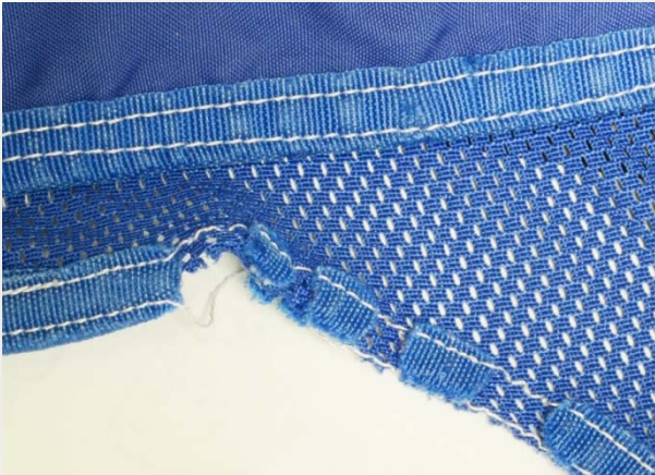
Edge Binding Decomposition

Decomposition of Edge Binding and other components of the sling are clear indicators of degradation from chemical treatment. Color loss and a chalky appearance is common. Stitching (comprised of a different material) may still be intact.