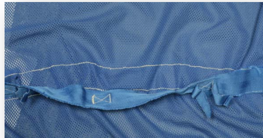
Back/Handle Strap Decomposition