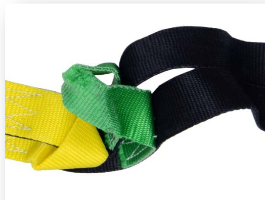
Stiffened and Brittle Loop Strap

Permanent crease, wrinkles along with brittleness increase chance that the fabric will suffer more damage from abrasion, internal fiber abrasion as well as external abrasion with other objects. Wash cycles with excessive agitation will increase abrasion and degradation of the fabric.