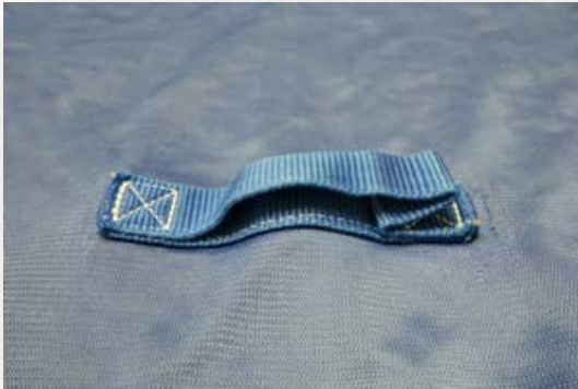
Handle with Permanent Crease

In addition to the loop straps, the back strap and sling handles if present will also show the permanent creases. Permanent creases will tend towards its original wrinkled position even when stretched out.