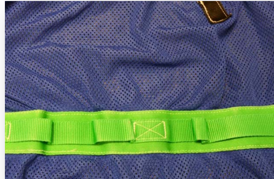
Back strap with Permanent Crease