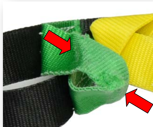
Color Loss and Chalky Appearance