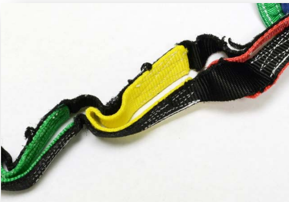
Loop Strap with Excessive Edge Abrasion

Strap Brittleness / Stiffness / Surface and Edge Abrasion are additional indicators that the sling may have been laundered in unsuitable conditions and has loss tensile strength. Loop straps that have stiffened or become brittle will tend remain in the state, position, or shape it is bent into instead of returning into a normal relaxed state.