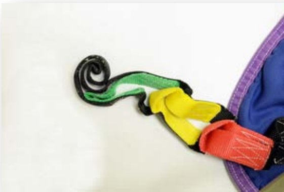
Extreme Loop Strap Curling

Extreme Curling / Permanent Wrinkles of loop straps can set in when the slings are dried at high heat or dried over an extended period of time. Heat combined with bleach or other chemicals will intensify the chemical action.