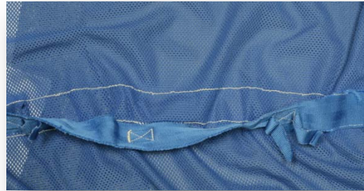
Back/Handle Strap Decomposition