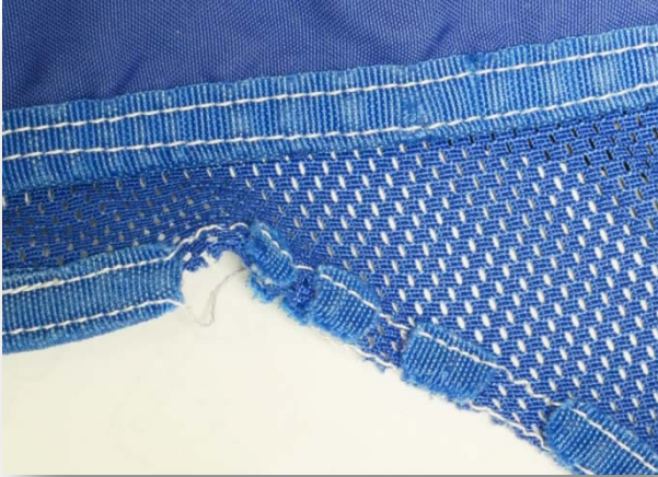
Edge Binding Decomposition

Decomposition of Edge Binding and other components of the sling are clear indicators of degradation from chemical treatment. Color loss and a chalky appearance is common. Stitching (comprised of a different material) may still be intact.