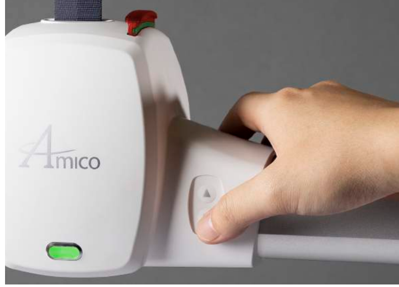
Up / Down Controls on Lift Motor