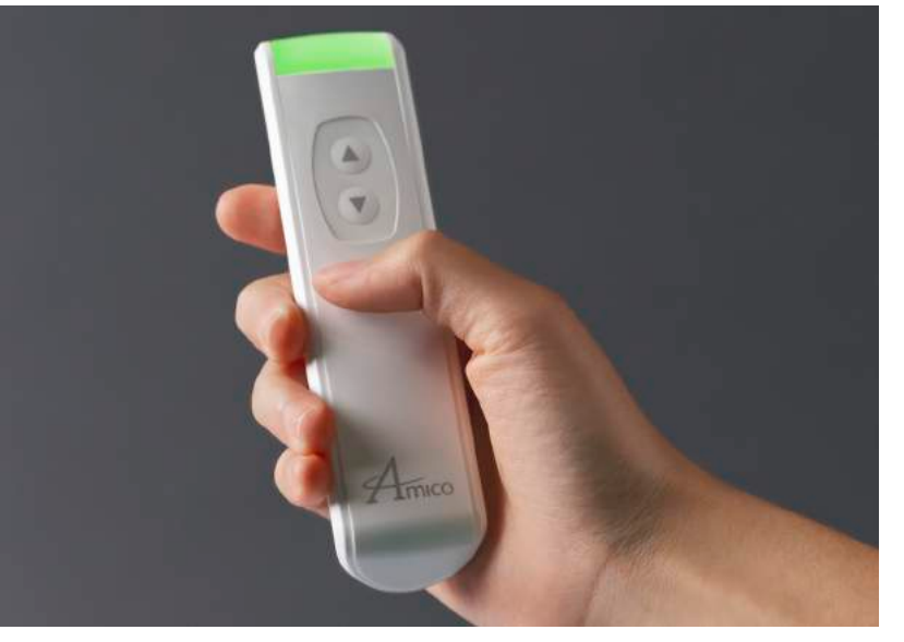
Wireless or Wired Hand Control