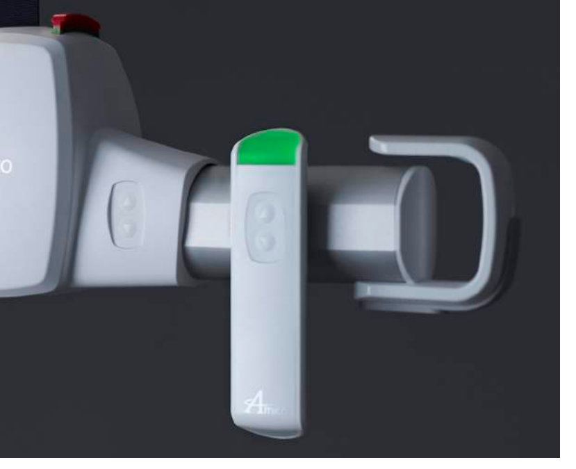
Magnetic Hand Control