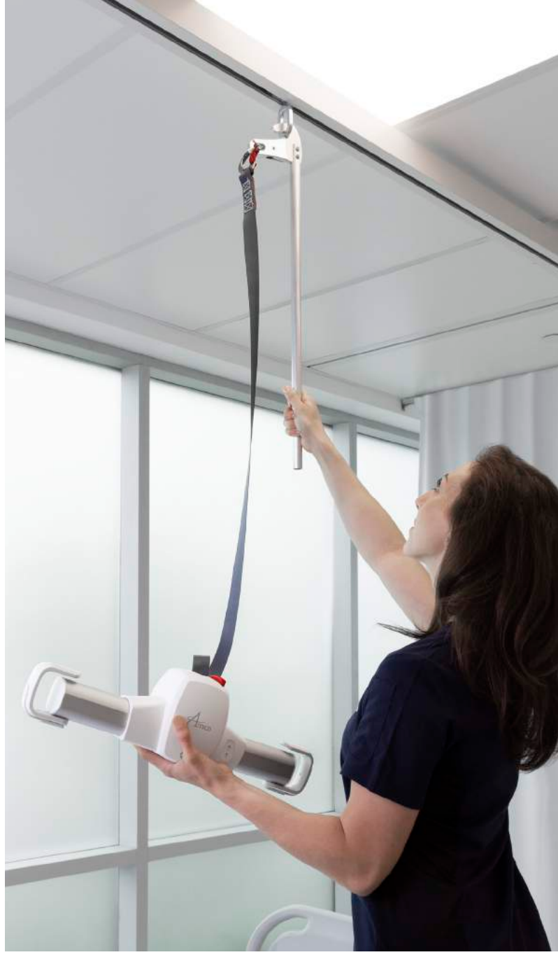
Reacher Bar Available