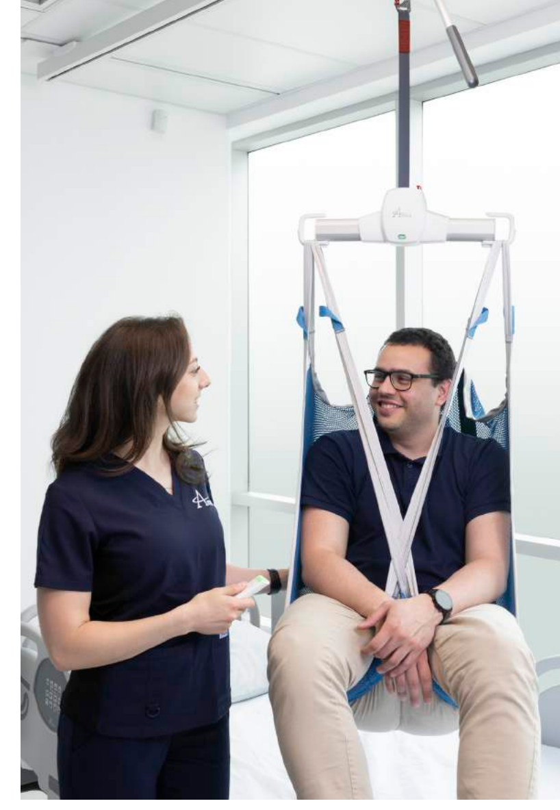
Safe Patient Handling