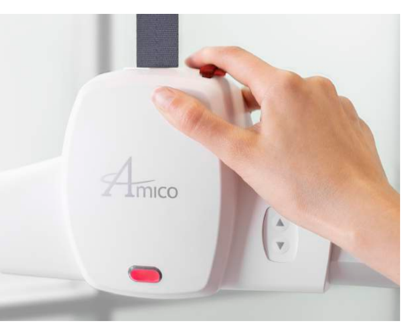
Emergency Stop and Lowering