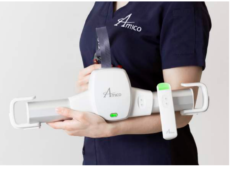
Weighs 6 lbs, Lifts 450 lbs