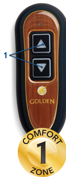
ONE ZONE POSITIONING SYSTEM

Comfort Zones 1 & 2 work together to create individualized wellness positioning and comfort. Each Comfort Zone can be adjusted independently by using the exclusive AutoDrive hand control.