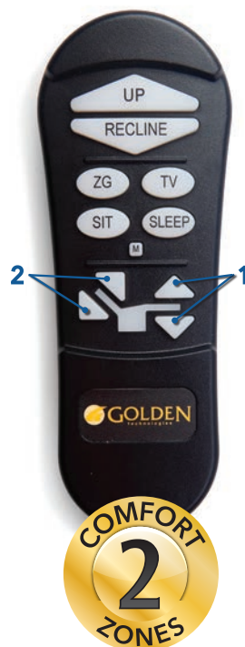
TWO ZONE POSITIONING SYSTEM

Comfort Zones 1 - 4 provide an ergonomic comfort experience with an emphasis on head and back support. Each Comfort Zone can be adjusted independently by using the exclusive AutoDrive hand control.