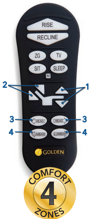
FOUR ZONE POSITIONING SYSTEM

Comfort Zones 1 - 5 This positioning system incorporates all five adjustable comfort zones to create the ultimate wellness comfort experience. Each Comfort Zone can be adjusted independently by using the exclusive AutoDrive hand control.