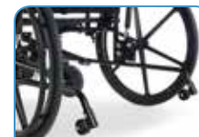
Anti-tippers (standard on Recliners)