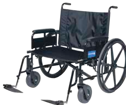
Regency Standard Bariatric Wheelchair with swingaway footrests and removable full-length arms