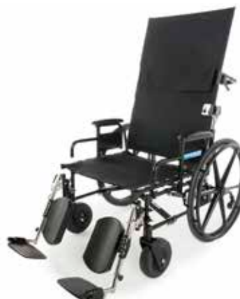
Regency Reclining Bariatric Wheelchair with elevating legrests and removable desk-length arms