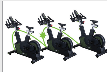
Connect Multiple Units