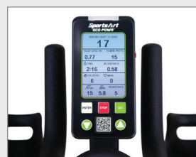
LCD Digital Display