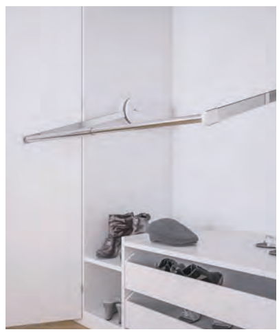
The motors takes little space in the wardobe.