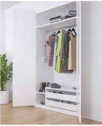
Butler in the upper position.