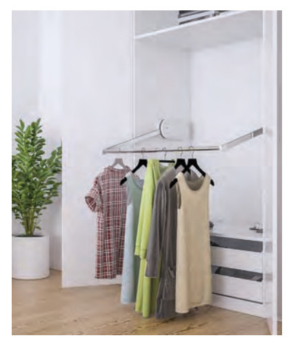
Butler lowers the clothes to a position outside the wardobe.