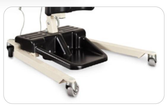
Power Base Adjustable Width from 22" – 33"