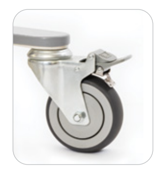
Front and Rear Locking Casters Secures Lift in Place