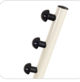
3 Oversized sling hooks on each side Safely secures sling to lift