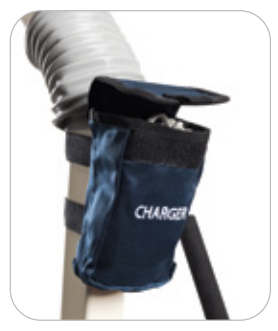
Charger Plug Storage Case - Included