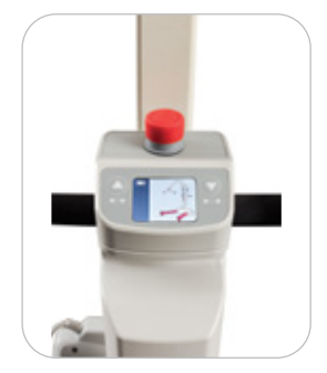
Dual Function Controls - by remote handset or on board