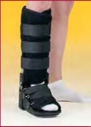
HCPCS Code: L4386