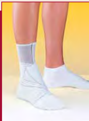
HCPCS Code: L1901