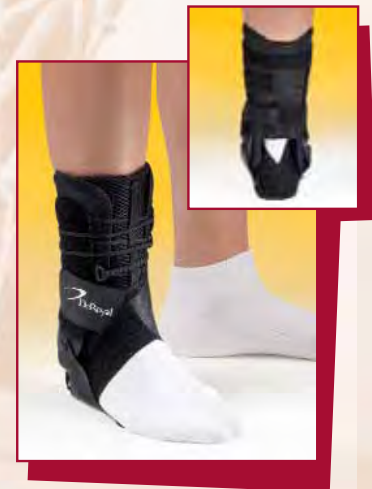
HCPCS Code: L1971

*Measure calf circumference 8" from ground Standard = < 10"; Wide = > 10"