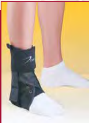
HCPCS Code: L1902

*Measure circumference from the base of heel around the ankle