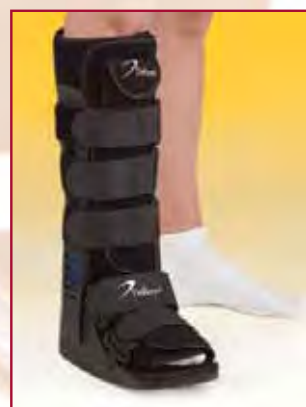
HCPCS Code: L4360