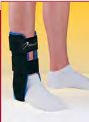
HCPCS Code: L4350