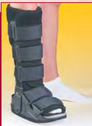
HCPCS Code: L4386