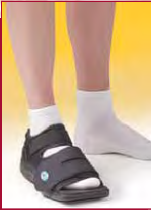
HCPCS Code: L3260 (Not Covered by Medicare)