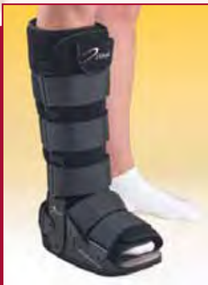
HCPCS Code: L4360