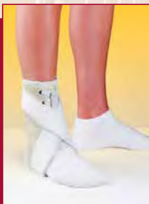
HCPCS Code: L1902