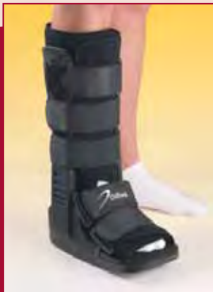
HCPCS Code: L4386