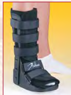
HCPCS Code: L4386