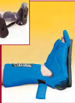
HCPSC Code: L4396