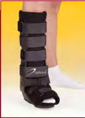
HCPCS Code: L4386