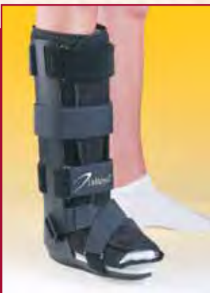
HCPCS Code: L4386