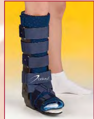
HCPCS Code: L4386