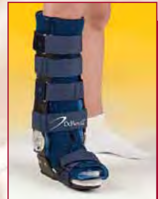
HCPCS Code: L4386