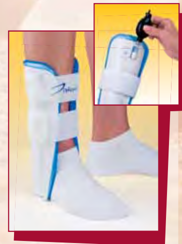
HCPCS Code: L4350