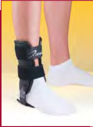
HCPCS Code: L1906