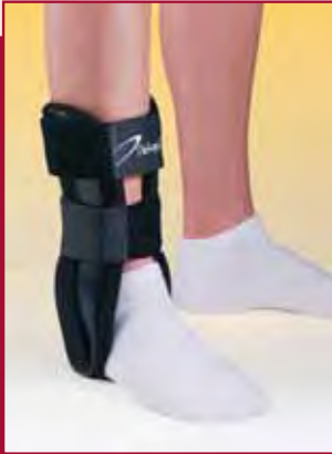
HCPCS Code: L4350