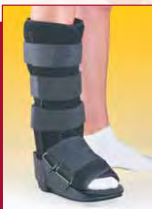
HCPCS Code: L4386