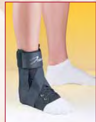
HCPCS Code: L1902