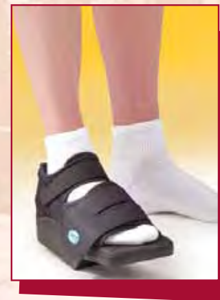
HCPCS Code: L3260 (Not Covered by Medicare)