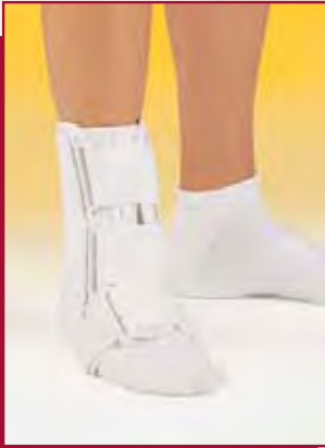
HCPCS Code: L1902