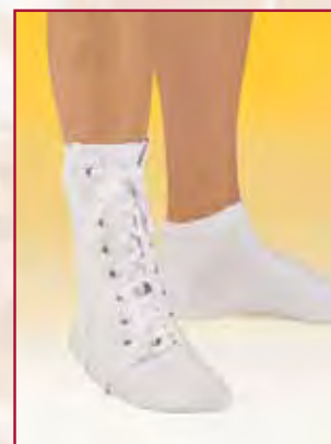
HCPCS Code: L1902

*Measure circumference from the base of heel around the ankle