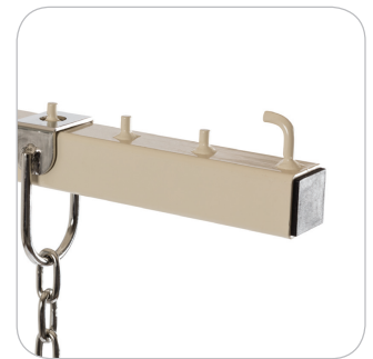
Adjust Chain Position from Edge of Headboard to end of Boom