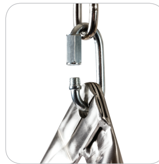
Adjustable Chain Height Locks Securely in Place