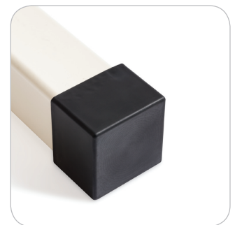
Rubber Coated Safeguards keeps Base Secure