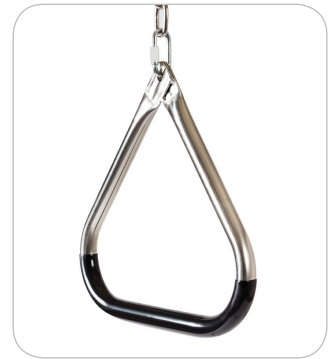
Rubber Coated Grab Bar allows for a Secure Grip