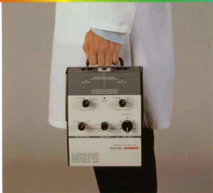
MS324AB Low Volt AC Muscle Stimulator features easy portability