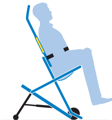
Standard Passenger Evac+Chair

Capable of carrying the largest of adults or 4 babies.