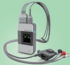
iT20 Telemetry System