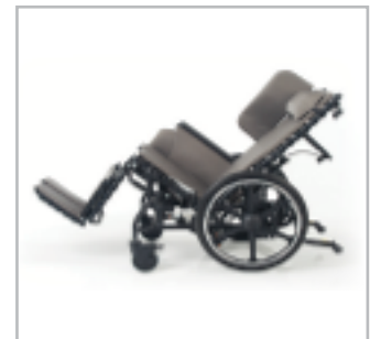
Posterior tilt effectively opens the diaphragm improving digestion, oxygenation, and organ function