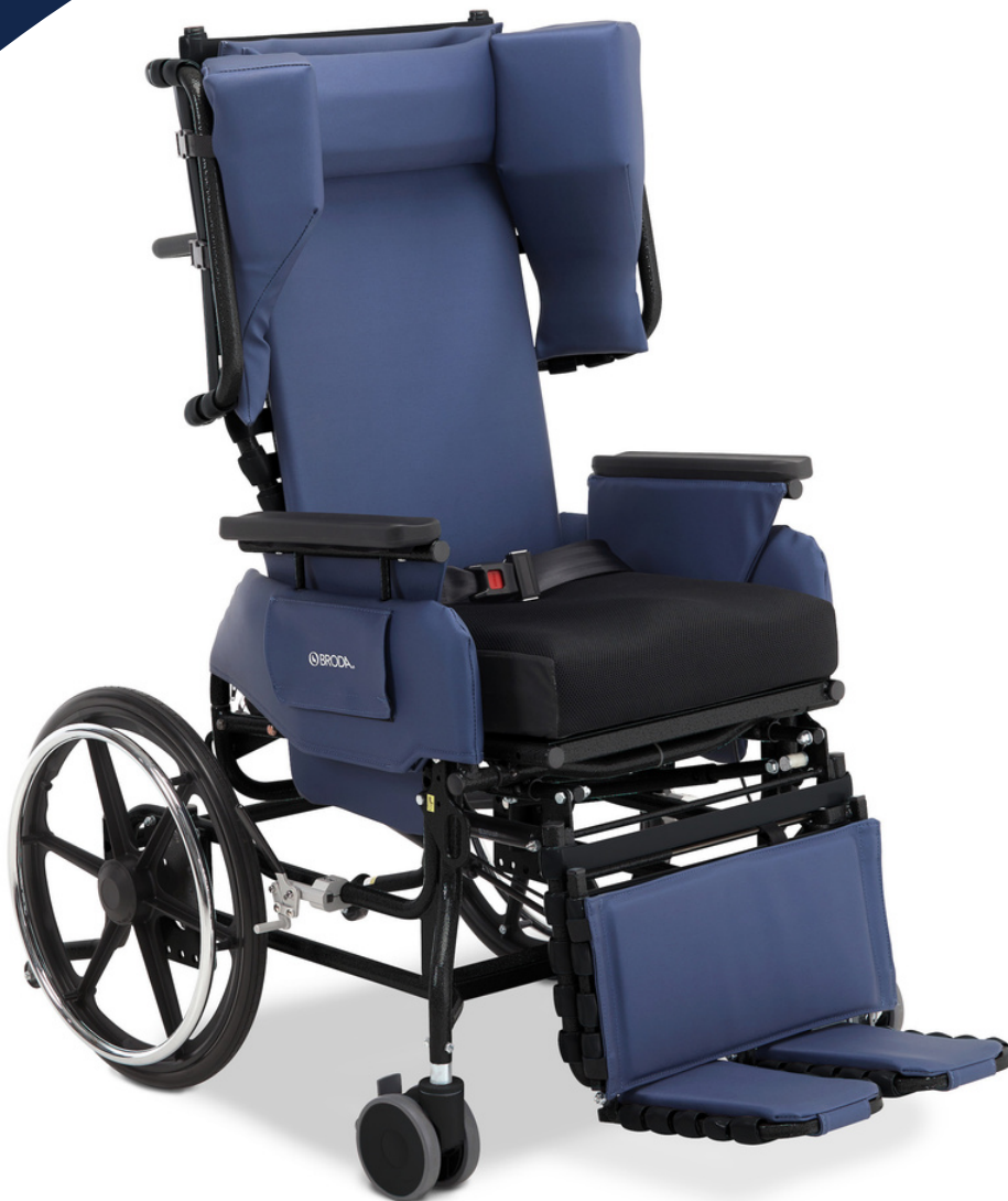
Shown with optional Matrix ® Libra seat cushion, twin locking caster wheels, and positioning belt