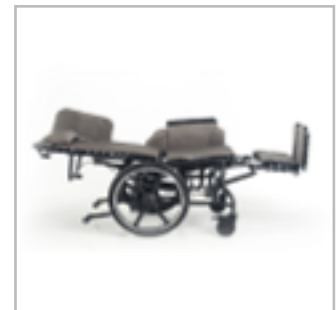
Adjustable tilt and recline help decrease postural deviations such as slumping, lateral lean and head drop