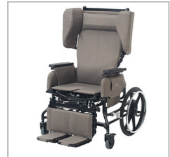
Rear mount mag wheels facilitate hand propulsion, allowing patients to engage in their surroundings