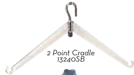
2 Point Cradle 13240SB

13011S For use with 13011, 13012, 13025, 13013, 13014, 13026, 13060, 13061, 1/cs.