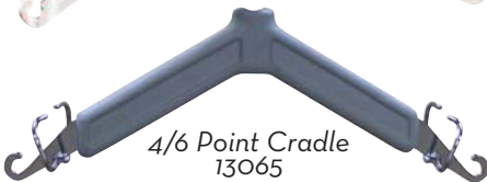
4/6 Point Cradle 13065