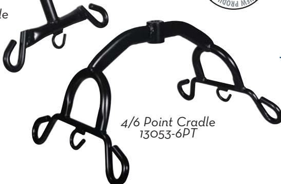
4/6 Point Cradle 13053-6PT