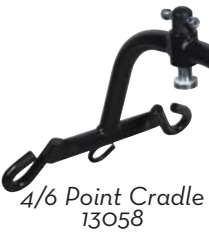
4/6 Point Cradle 13058