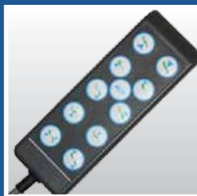
Handset Remote Control