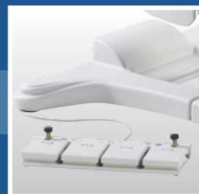
Moveable Arm Rests