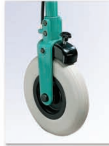
SLOW DOWN BRAKE