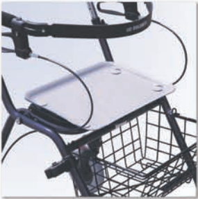
FOOD & BEVERAGE TRAY