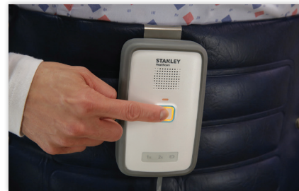
A wide array of mounting options allow the M200 to be affixed to a headboard, wall, wheelchair, side chair, or by a toilet.

For more than 30 years, STANLEY Healthcare has partnered with thousands of healthcare facilities. Across the U.S. and around the world, our innovative fall management solutions are helping improve patient and resident outcomes while enhancing caregiver efficiency. The M200 represents our most advanced fall management solution. It’s a compelling opportunity for your facility to take its program to another level in terms of quality, safety and efficiency. It’s also a way to support cost-saving goals—empowering you to reduce the incidence of falls (“never events”), purchase fewer monitors and drive operational efficiencies through greater standardization across your organization.