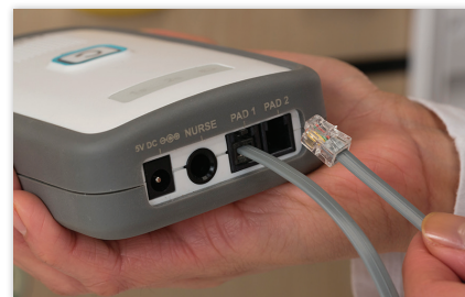
Connect two pads to a single monitor at the same time—no need to continually disconnect and reconnect pad cords.