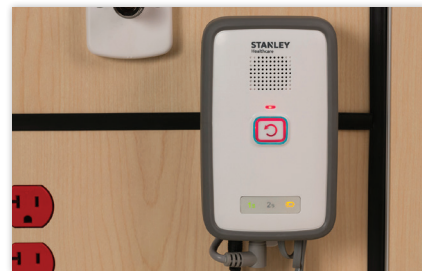
Audible and visual feedback confirms desired alarm settings and when an individual is actively being monitored.