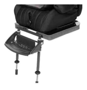
Footrest, long with footrest adapter