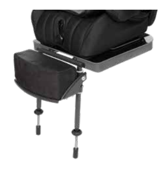
Footrest, short with footrest adapter and footrest pad