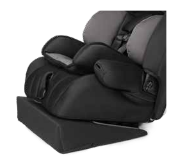
Seat wedge, below (+ 10°)