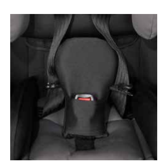
Crotch pad, large

Defender Reha AND all accessories exceed US FMVSS 213 and Canadian CMVSS 213 standards