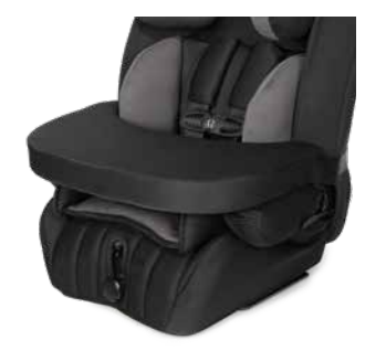
Table = playtray and additional impact shield