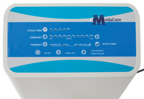
User Freindly Digital Control Panel