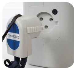
Patented Quick Connect Hose with Transport Function