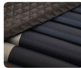
Quilted Cover with Hidden Zipper