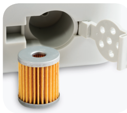
Quick-Change HEPA Filter System