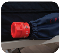
Patented Quick Inflate/Deflate System