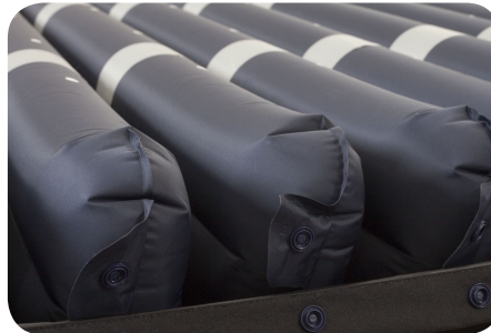
EZ SNAP-IN-SNAP-OUT REPLACABLE CELLS