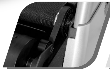
12 Groove Poly-V Belt