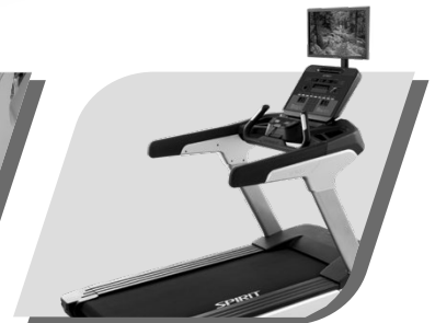
Optional TV Bracket (TV not included)

Robust construction and commercial-grade components make the CT900 the standard for any treadmill to measure against. Specifications for the rollers, belt and deck were meticulously chosen to give users a smooth workout experience. Powder-coated steel, powerful motor, and outstanding warranty allow owners to rest assured they have products that will stand the test of time.